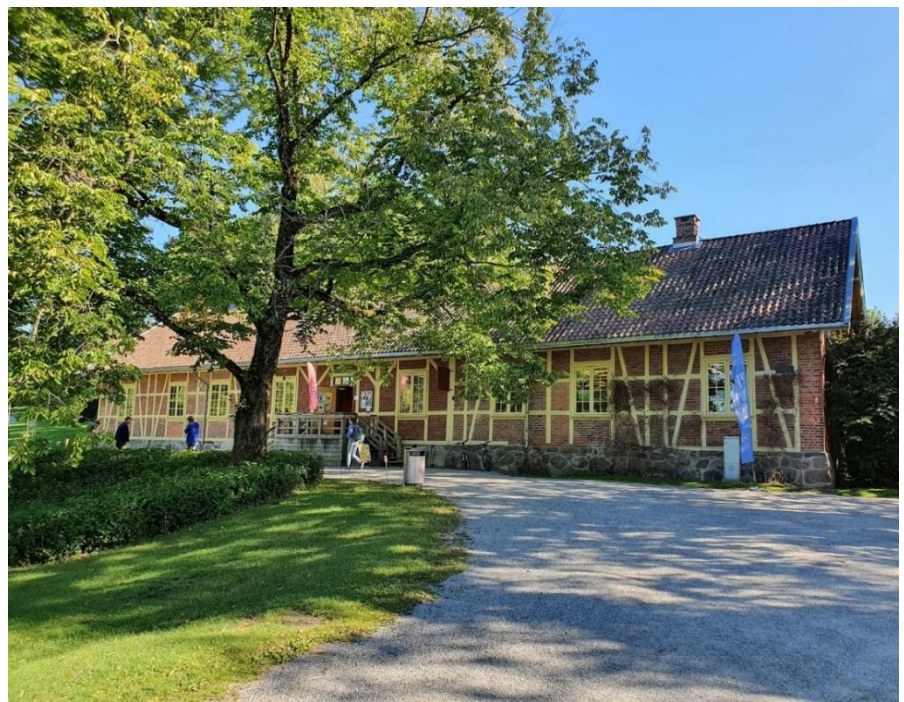
The SiÅs Housing Office and Boksmia (university bookshop) are housed in the above building which is located next to the duck

If you will be living on campus, you must arrange to pick-up your keys from the SiÅs Housing Office. The office is located next to the duck pond as shown on MazeMap . Regular office hours are between 10:00 – 15:00 during weekdays. You can email them at utleie@sias.no with your arrival date and time. If you are arriving after hours, they will provide special instructions for how to pick-up your keys. Remember to inform SiÅs of your time of arrival.