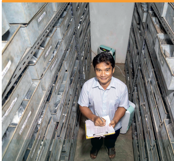
Medium-term storage facility at the Lao National Genebank.

The BOLD Project focuses on strengthening food and nutrition security worldwide by supporting the conservation and use of crop diversity.