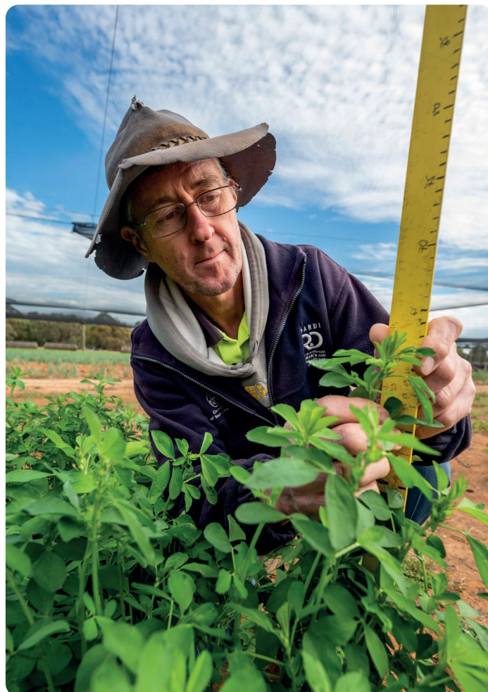
BOLD is working with partners in Australia to make alfalfa diversity available to farmers worldwide.

Genebanks should not be “museums” where seeds are kept frozen in time and admired from behind panes of glass, but rather should be a dynamic part of the seed systems that farmers use to diversify their crop options and that underpin resilient production systems and diversified diets. Seed systems include all of the activities that contribute to variety development and making sure that crop diversity makes it to farmers’ fields. Research is underway, led by the Norwegian University of Life Sciences, to identify how best to strengthen the connection between genebanks and others involved in seed systems in developing countries to make sure that farmers and plant breeders, in particular, have access to the crop diversity they need. The project is working with partners in Bhutan, Ecuador, Tanzania and Uganda to understand their seed systems and to use this knowledge to develop models of genebank engagement that other countries will be able to use and adapt.