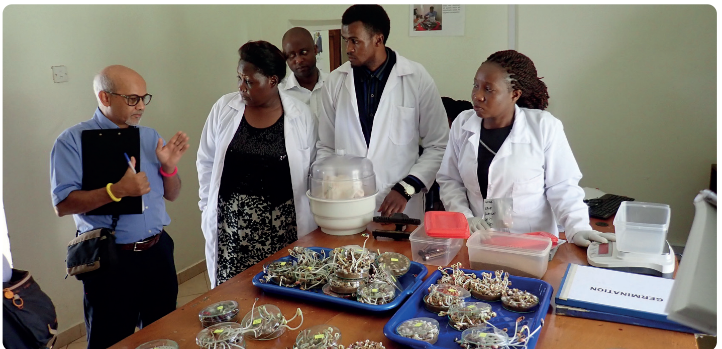
Genebank evaluation at the national genebank of Uganda.